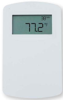
North American style