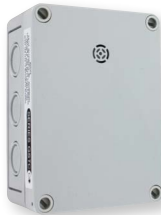
Wall mount without LCD