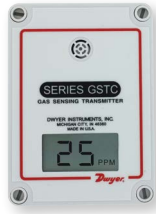
Wall mount with LCD

High Accuracy Electrochemical Sensor, Universal Output or BACnet or Modbus® Communication Protocol Options